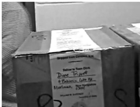
"Sealed" Ballot Box